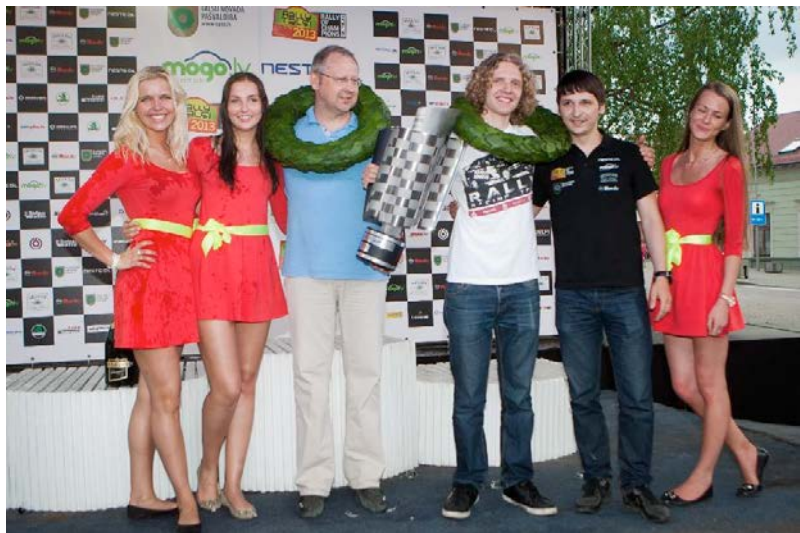
Champions' Challenge Cup winners 2013