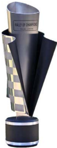
Champions' Challenge Cup

Rally Talsi for already sixth time will bear a name of Rally of Champions and will host a fierce competition for the Champions' Challenge Cup . The goal of the competition is to provide equal conditions for the N4 group champions of the previous rally season and sort it out, who is the fastest of them all. Rally of Champions has seen champions from the Baltics, Scandinavia, Belarus, Great Britain, Russia, and Slovakia, as well as drivers, who are now competing for the title of the 2014 World Rally Championship – Norwegians Andreas Mikkelsen (Volkswagen Motorsport) and Mads Østberg (Citroën Total Abu Dhabi World Rally Team) . Who will outcompete others in 2014 to bring home the glory and for a year also Champions' Challenge Cup ?