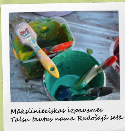
Mākslinieciskas izpausmes Talsu tautas nama Radošajā sētā