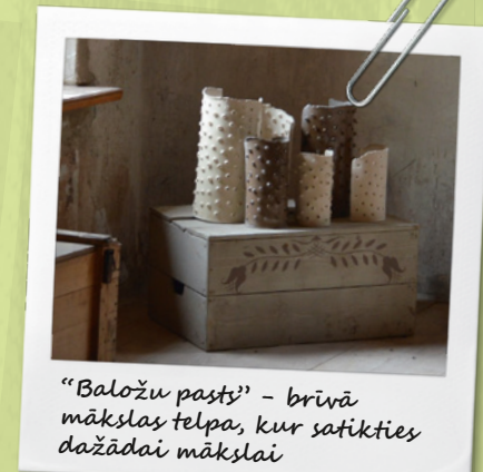
"Baložu pasta" - brīvā mākslas telpa, kur satīties dažādai mākslai

Piesakies Talsu novada tūrisma informācijas centrā, Lielā ielā 19/21, Talsos 63224165, 26469057 www.talsitourism.lv