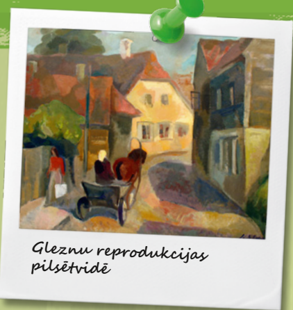
Gleznu reprodukcijas pilsētvidē

No 2017. gada 1. jūlija pastaiga "Māksla uzzied Talsos!"